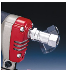
Unique Tangle Free Swivel Joint